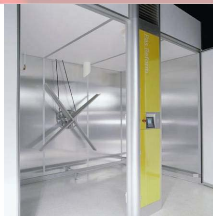
Robust, easy-to-clean construction

Fully automated processes deliver greater accuracy, and SmartHatch™ monitors and adjusts the hatching process automatically from the day of transfer through to the last chicks hatching, eliminating any need for human intervention. Field trials have proven that the systematic measurement and control of temperature, humidity and CO 2 production, combined with the use of current and historical data to adjust the hatcher environment automatically consistently produce high levels of uniformity per batch.