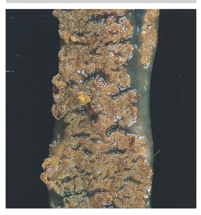
FIGURE 1*: Intestinal Lining. Typical Necrotic Enteritis lesions, demonstrating a crusty, velvet-like appearance.

The main effect of NE is reduced performance but there can also be an increase in mortality. These effects have serious implications on economic efficiency and bird welfare.