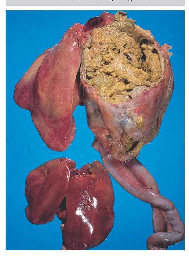
FIGURE 3*: Liver and intestine of normal (i.e. lower left) and age-matched bird with Cholangiohepatitis. In the affected liver, a distended bile duct has been incised to show the material causing enlargement.

A summary of factors thought to influence the occurrence of NE is provided in Table 1.