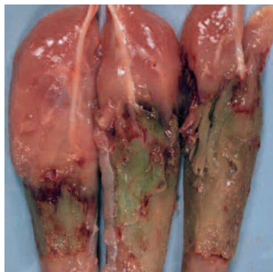
Figure 1: Deep Pectoral Myopathy

DPM was first described in mature breeder turkeys and broiler breeders, but is being seen more in meat-type chickens, especially those selected for breast muscle development. The affected muscles are discarded during de-boning, resulting in saleable yield losses. However, the major issue with DPM is that if the birds are marketed as whole carcasses or parts, the problem is rarely detected during processing, resulting in consumer complaints and making the cause of the problem difficult to identify.