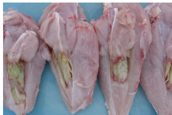
Figure 4: Aged Pectoral Myopathy

Category 3: The progressive degeneration and greening of the damaged tissue ( Figure 4 ). Often, only the middle part of the fillet is involved and the progressive greening is in parallel with the loss of cellular structure, so that a 'putty like' consistency develops within the lesion. This green, necrotic area will persist and through time will gradually reduce in size as it is reabsorbed, so that the symmetry of the breast is lost in some older birds. The green colour is produced by the breakdown of haemoglobin and myoglobin to bile salts.