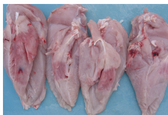
Figure 3: Pectoral Myopathy – Developing Lesions

Category 3: The progressive degeneration and greening of the damaged tissue ( Figure 4 ). Often, only the middle part of the fillet is involved and the progressive greening is in parallel with the loss of cellular structure, so that a 'putty like' consistency develops within the lesion. This green, necrotic area will persist and through time will gradually reduce in size as it is reabsorbed, so that the symmetry of the breast is lost in some older birds. The green colour is produced by the breakdown of haemoglobin and myoglobin to bile salts.